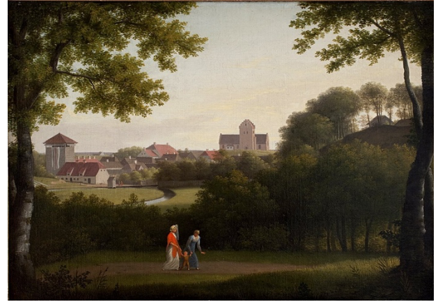
Prospect of Lyngby, 1803 – 1810, C. W. Eckersberg (1783-1853)