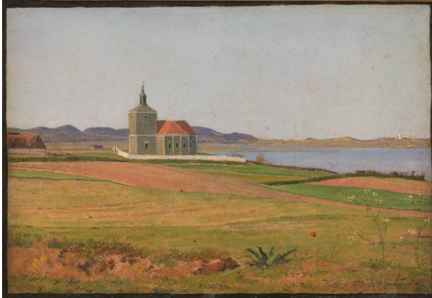
Vinderød church in Frederiksværk, 1837, J. T. Lundbye (1818-1848)