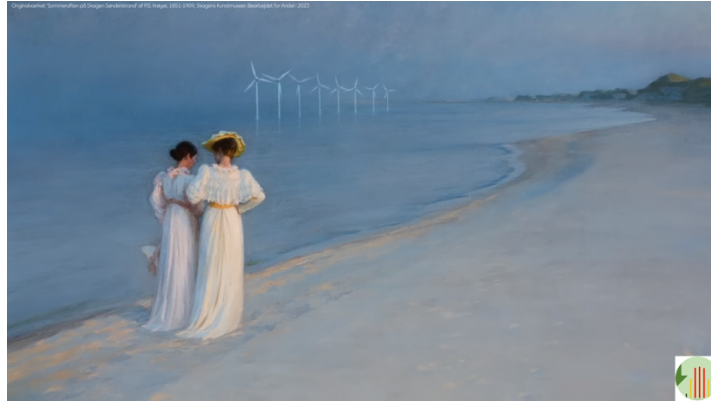
Contemporary version of P. S. Krøyer, A Summer Night on the Southern Beach of Skagen, 1893

phenomena – water, fire, mud - and frightened people. A voice-over comes to our rescue, stating that if we want to keep our Danish idyl, we need to change the image of it. And then: cut to some of the most iconic images of the Danish landscape – but now with windmills in the horizon: